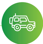
4WD & Leisure